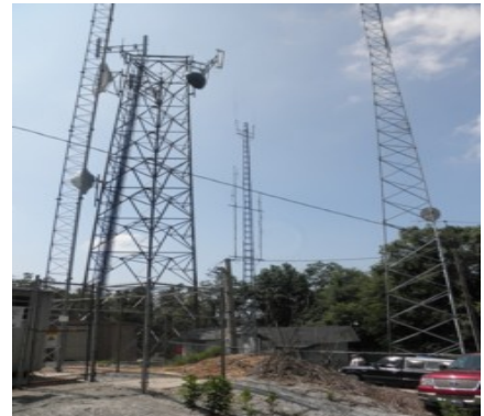
Our KE4RX/r tower with the antennas installed (center)